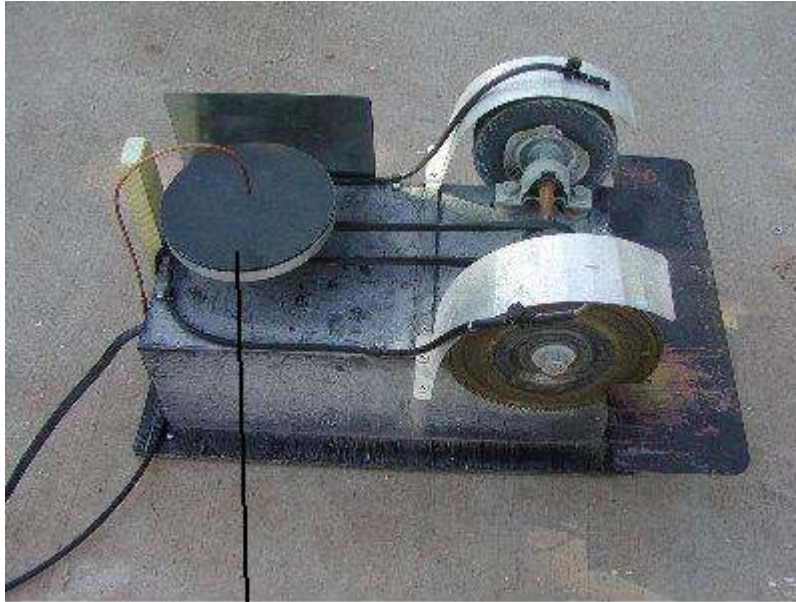
New polishing head, accepts different grit pads for shaping and polishing stones.

Now having used the little rock saw/grinder a while Linda wanted some way to finish grinding and polishing the rocks on the same machine. So we ordered a polishing head for it. This motor has a long output shaft so I was able to flip its pulley upside down, slide it down a bit, and mount the head no problem.